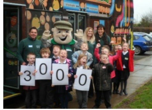
Billinghay school children outside the Branston Potatoe BuS